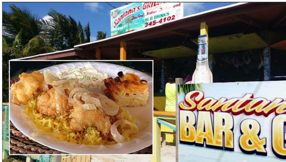
The Grouper at

Santana's was the best we have ever tasted.